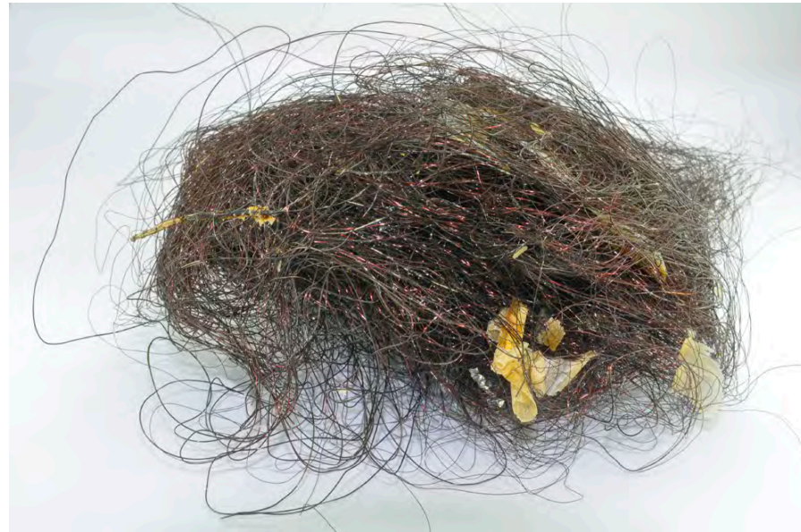
Original wire from a freshly-unwound transformer.

It should sound as good as when it left the showroom in 1960. The only other option, as far as upgrading the tone, would be to try one of our ToneClones , which are copies of the finest celebrity-owned and played “pick of the litter” transformers. It's likely you've heard these transformers in action on your favorite recordings.